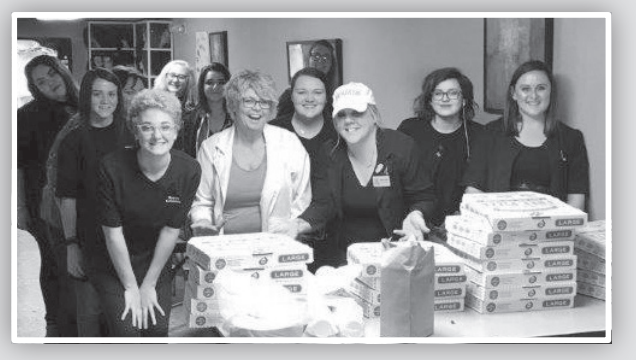
Some of our Friends at Black Hills Beauty College.